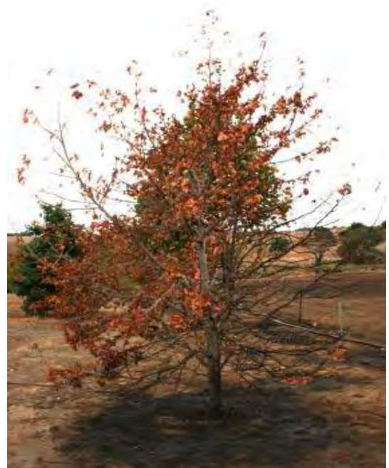
Burning mulch damaged this tree. Its mate escaped more or less unscathed.

Water and fire are inimicable so it should perhaps not surprise that being waterwise and firewise should sometimes conflict. For example, mulching is a very useful and sensible water conservation technique but some of the most readily available materials - woodchips and shredded or composted bark - become a problem if ignited in a fire as they can become extremely difficult to extinguish, requiring recurrent attention to do so. Mulch can cause the loss of plants that would otherwise survive a passing fire. Non-flammable materials such as pebbles or gravel are to be preferred where fire presents a threat even if they are less practical or desirable. (Plastic underneath mulching materials can also create a hazard)