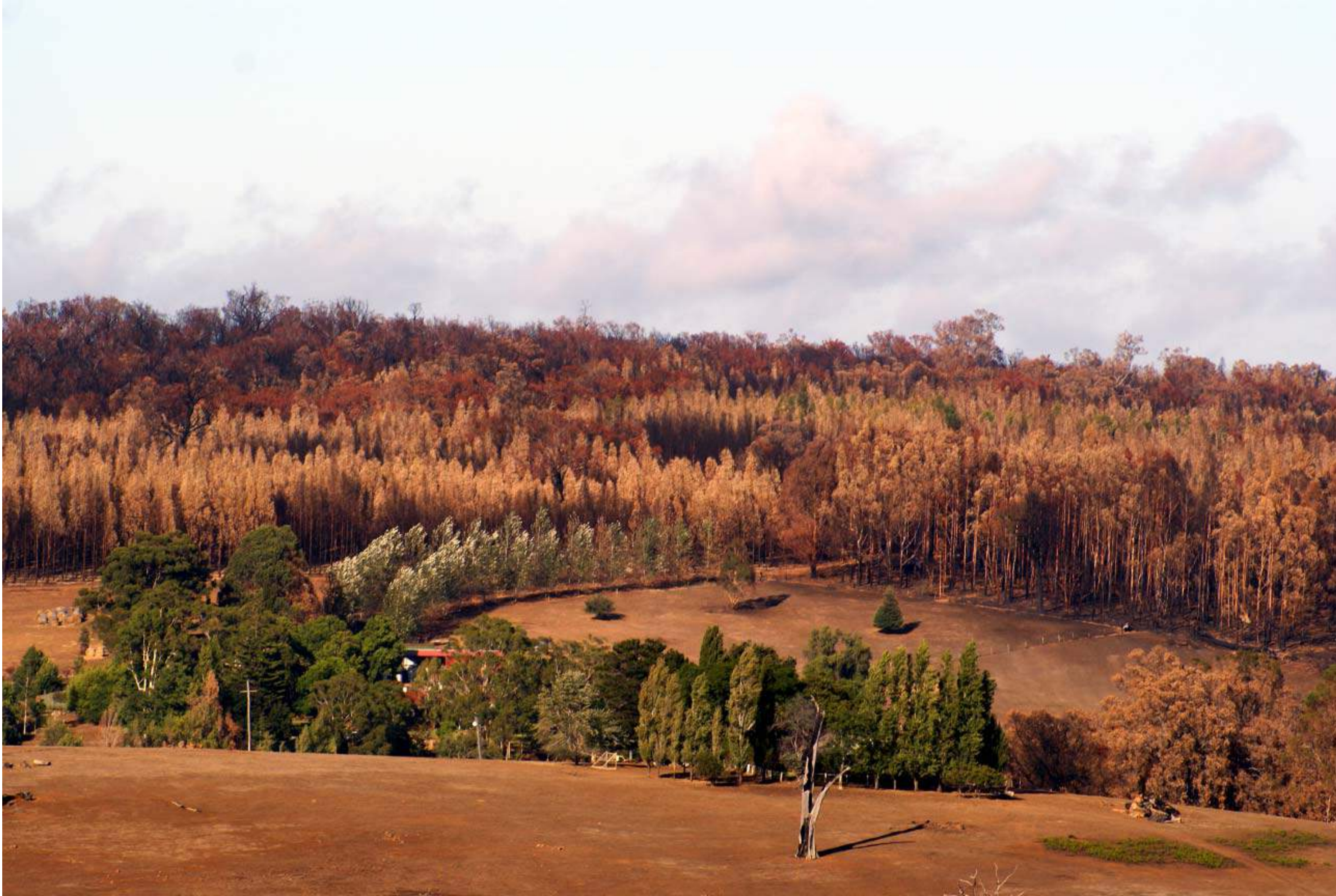
Overview: The fire approached from the Background.

"The Poplar avenue split the fire into two when it came out of the Blue Gum plantation. It went around the garden on either side...My plantings around the homestead have intuitively been fire retardant. "