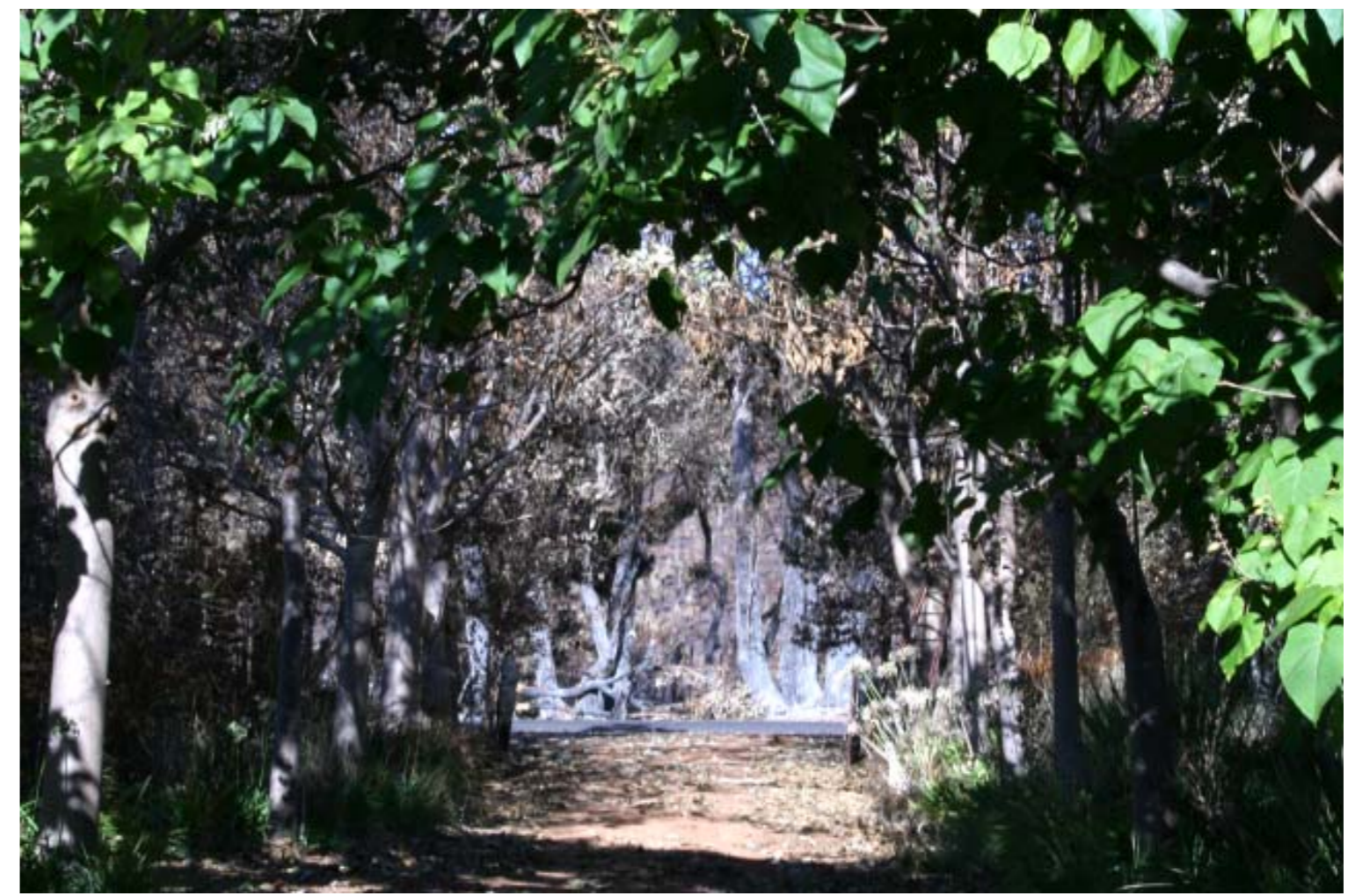
Inside Looking Out Admixture of eucalypts amongst fire retardant trees on this edge saw the fire carry part of the way in.