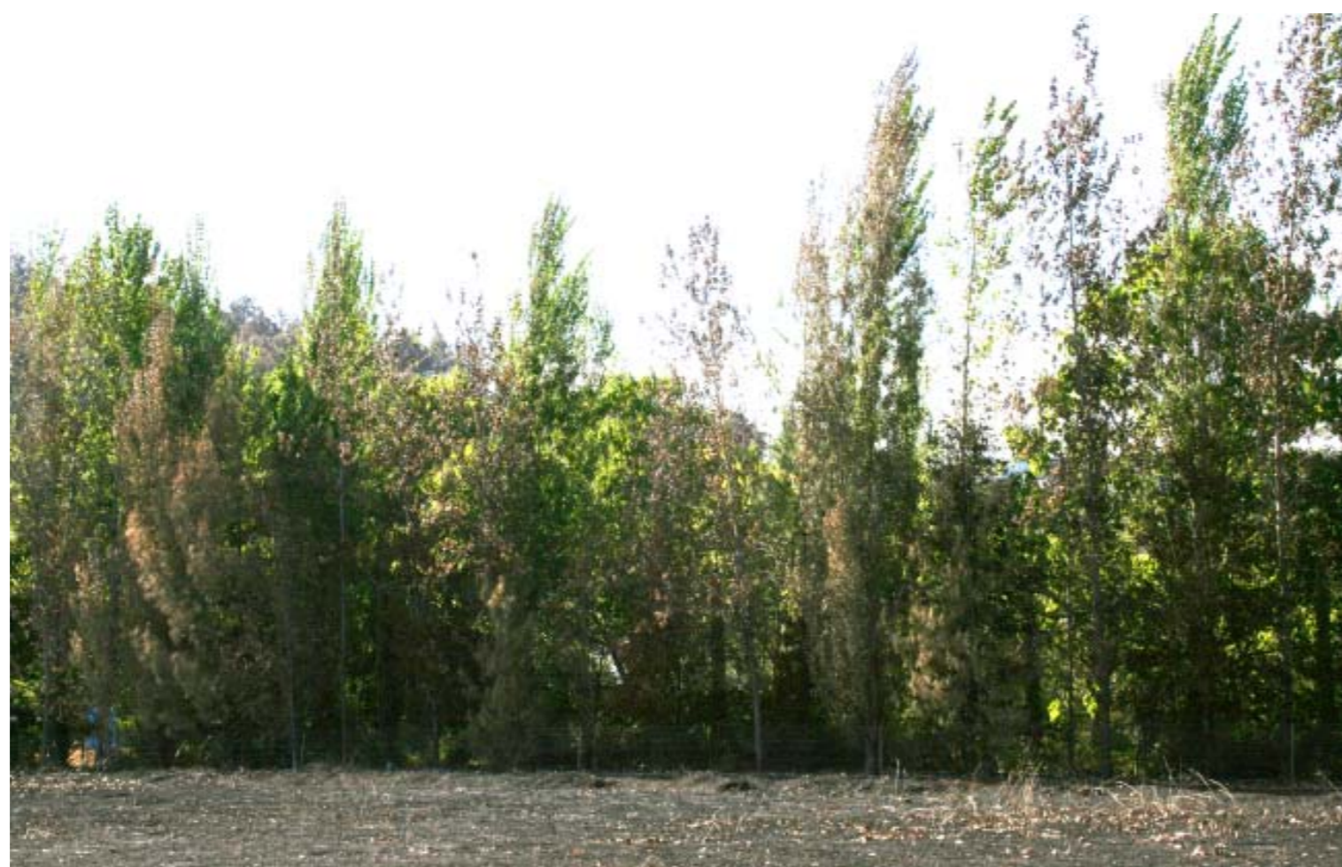
Outside Looking In Only the outsides of the edge trees are scorched.