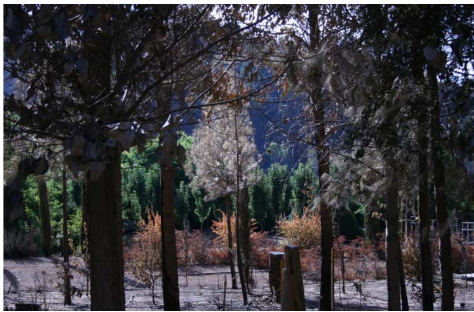
Outside Looking In Young plantings on bare ground created a gap which helped cut the radiant heat. The older fire retardants did the rest.