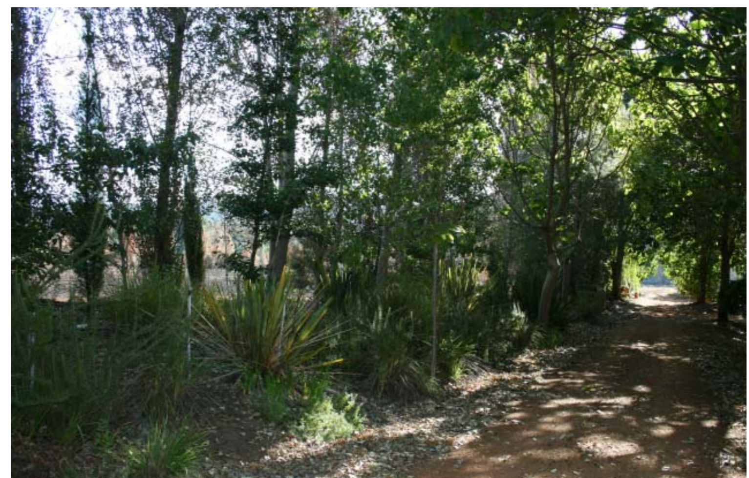
Inside Looking Out From the inside the impact of the fire upon the edge is hardly noticeable.